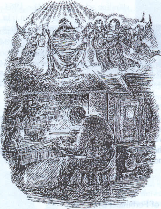
Illustration by Ann-Margret Dahlquist-Ljungberg Old Man sitting at the hearth with Psalmodikon